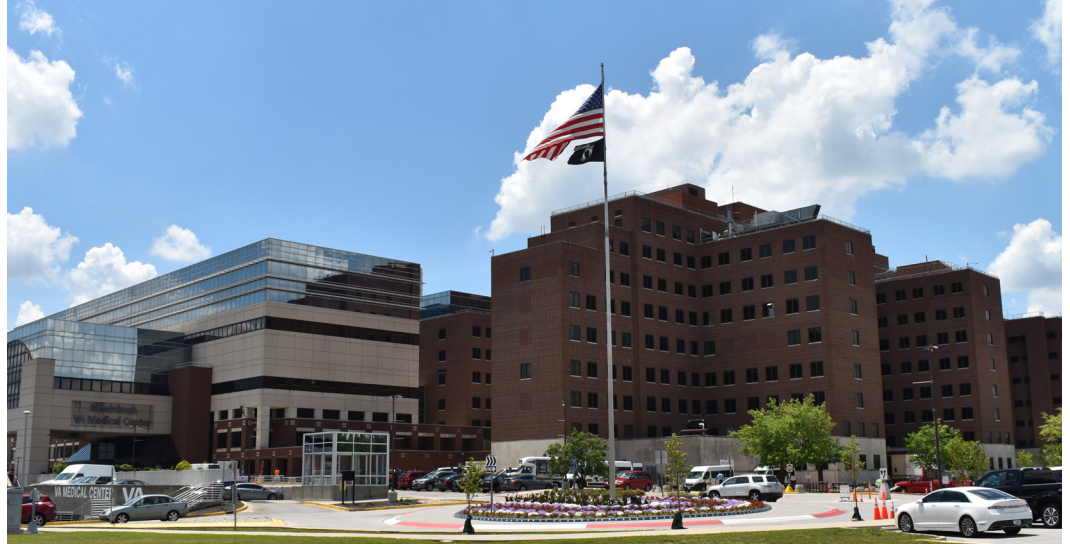
Richard L. Roudebush VA Medical Center 1481 W. Tenth St. Indianapolis, IN 46202 / 317-554-0000