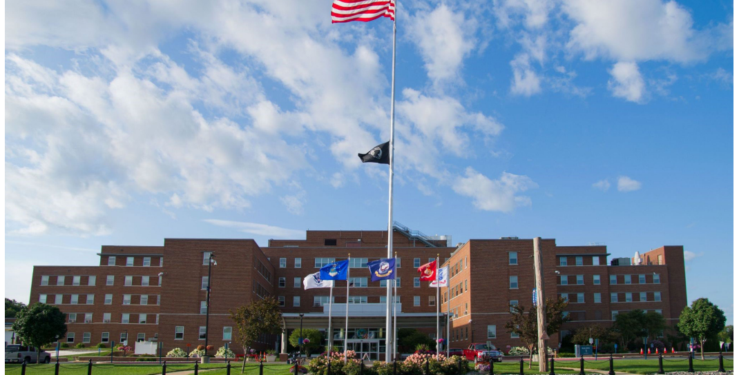
Aleda E. Lutz Saginaw VAMC 1500 Weiss St. Saginaw, MI 48602 / 989-497-2500