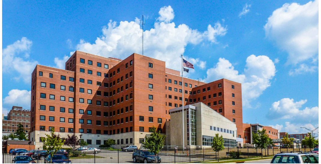
Cincinnati VA Medical Center 3200 Vine Street Cincinnati, OH 4522 / 513-861-3100