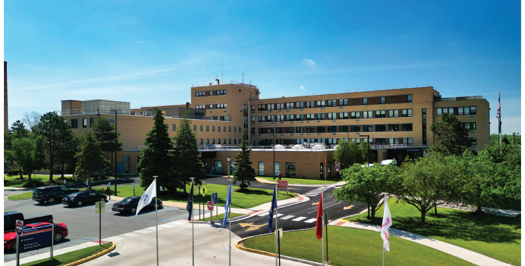
Fort Wayne Campus 2121 Lake Ave. Fort Wayne, IN 46805