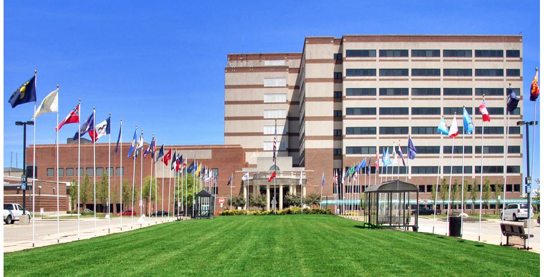
Dayton VA Medical Center 4100 W Third St, Dayton, OH 45428 / 937-268-6511