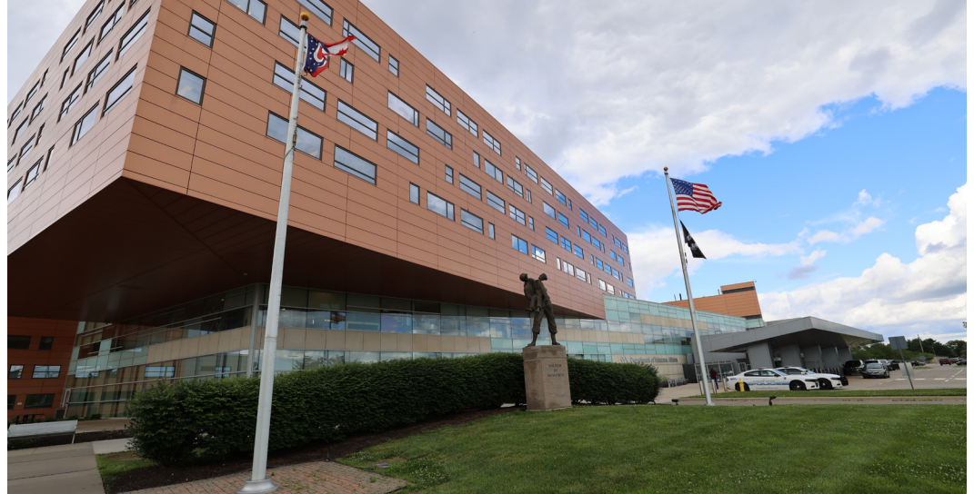
Chalmers P. Wylie VA Outpatient Clinic 420 N. James Rd. Columbus, OH 43219 / 614-257-5200