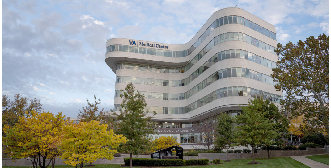
Louis Stokes Cleveland Department of Veterans Affairs Medical Center 10701 East Blvd. Cleveland, OH 44106 / 216-791-3800