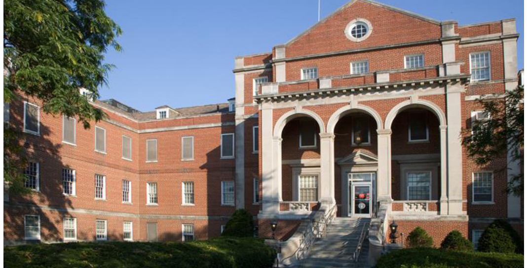
Chillicothe VA Medical Center 17273 State Route 104 Chillicothe, OH 45601 / 740-773-1141