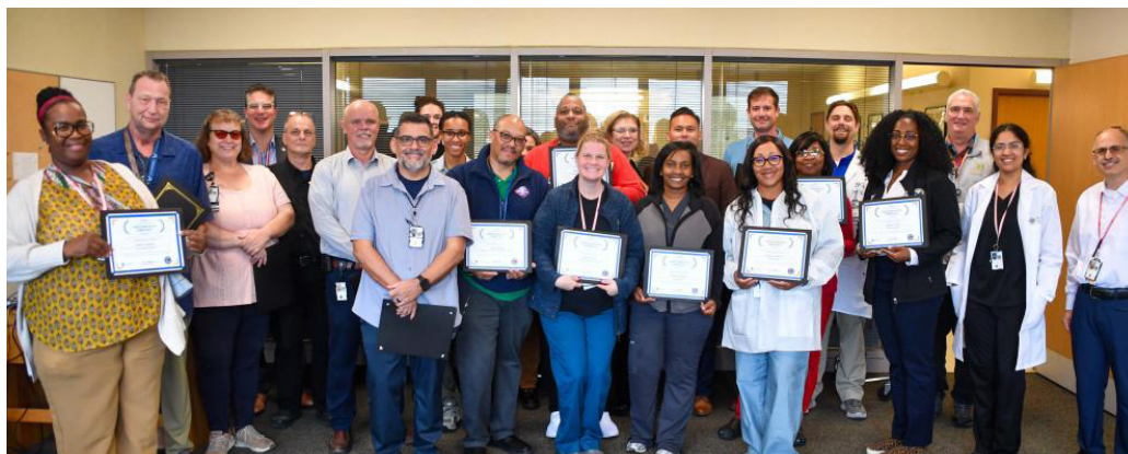
Downriver VA Clinic 1640 Fort Street, Suite D Trenton, MI 48183-2040 734-559-8101