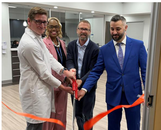
Pontiac VA Outpatient Clinic 44200 Woodward Ave. Suite 208 Pontiac, MI 48341 248-332-4540