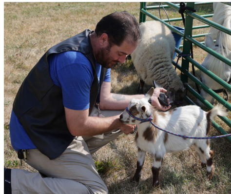
Columbus VA Clinic 2720 Airport Dr., Suite 100 Columbus, OH 43219 614-388-7650