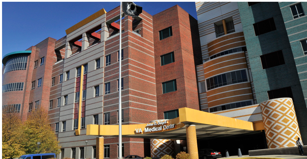
John D. Dingell Detroit VAMC 4646 John R St. Detroit, MI 48201 / 313-576-1000