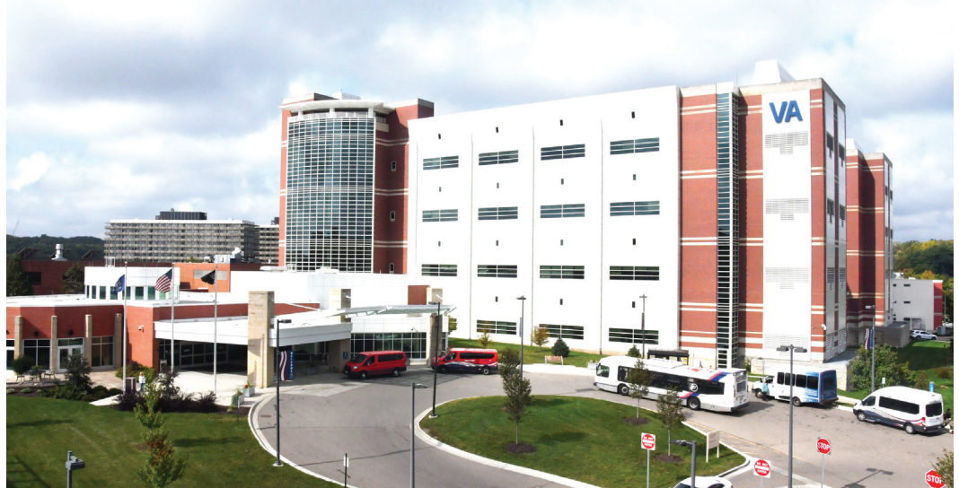
Lieutenant Colonel Charles S. Kettles VA Medical Center 2215 Fuller Road Ann Arbor, MI 48105 / 734-769-7100